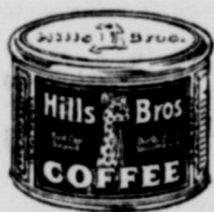
In the Original Vacuum-Pack which keeps the coffee fresh.

A GENERATION following the storied stampede of the Forty-niners (in 1878, to be exact) another event of importance took place in the West—the birth of Hills Bros. Red Can Coffee. The coffee-pot became a serious contender for the laurels of the prospector's pan.