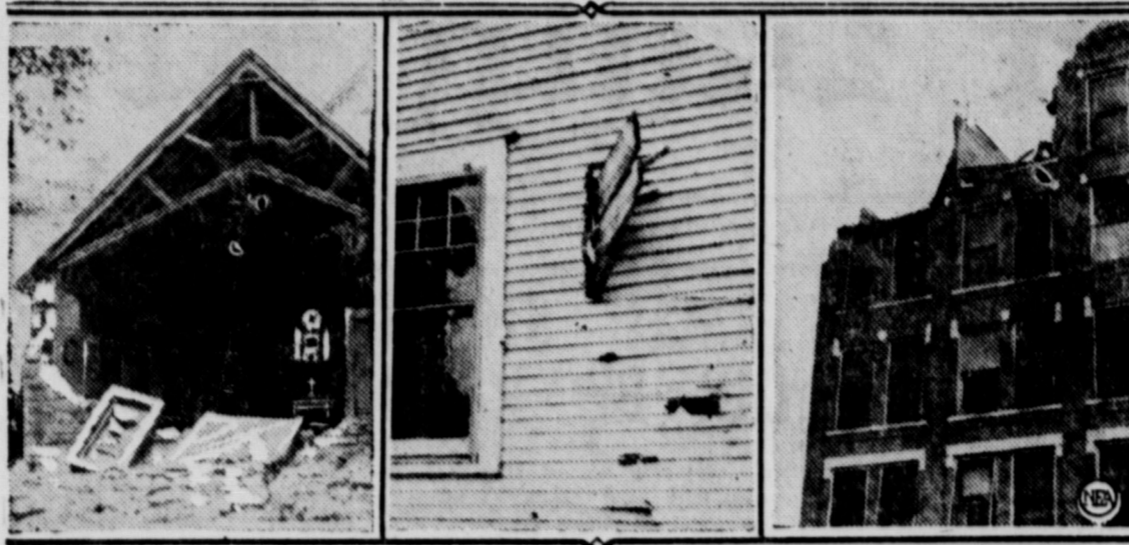
These are just a few of the freakish stunts a tornado pulled in Augusta, Kas. The picture at the left shows the Episcopal Church minus its front. In the center one sees a board, from some other building driven into the side of a house. At the right is seen a five-story office and apartment building with one corner entirely gone.