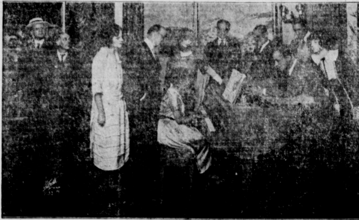
A SCENE FROM "SIX CYLINDER LOVE" A High Powered Farce Comedy that "Hits on All Six and Furnishes Laughs at a Mile a Minute Clip, at Chautauqua.

It is no longer how many good roads a community can afford to build, but rather how few a community can afford to build. In other words, good roads, are as much a part of development of a community as any-