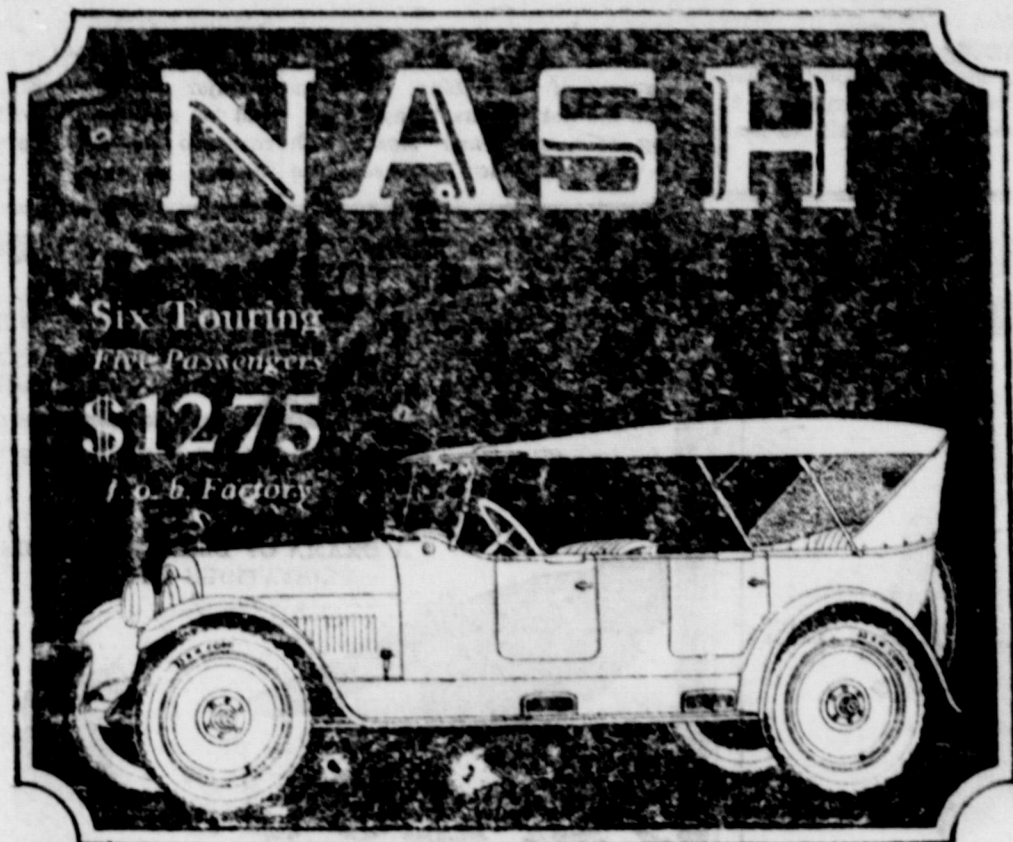
Five Spoke Wheels and Nash Self-Mounting Carrier, $25 additional

Sheer Superiority! Here's convincing proof this Six Touring does excel. Wheelbase is 2 to 9 inches more than cars of like price offer. Sturdy top has five bows. Many have but four. 17 days are devoted to body painting. There are 16 coats. So you get a finer finish and longer-lasting lustre. All through the car Nash gives more in real quality.