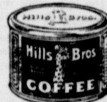
In the Original Vacuum-Pack which keeps the coffee fresh.

© 1924, Hills Bros. THE H. O. WOOTEN GROCER CO., Sweetwater, Texas. Exclusive Wholesale Distributors