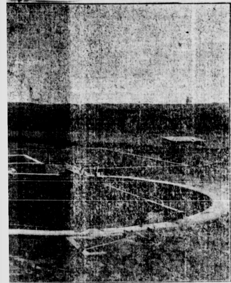
DISPOSAL PLANT State Bureau of Sanitary Engineering where it was printed

Texas to the great summer playgrounds of Colorado. It crosses the Bankhead at Sweetwater and swings to the northwest to Amarillo—the main motor gateway to the South Plains Panhandle section paralleling the Santa Fe railway.