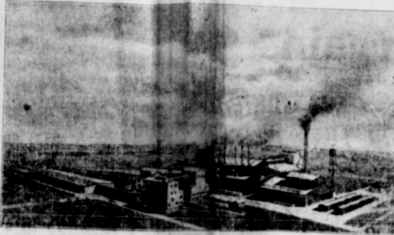
PLANT OF THE UNITED STATES GYPSUM CO. AT SWEETWATER. Construction work for this plant will begin in a few days according to officials of the company. Nearly 1,500 acres of rich gypsum and gypsite deposits have been purchased since the first of the year here. Land, plant, trackage and other equipment will represent an investment of approximately $1,000,000 to be made here for the manufacture of sheet-rock, and the 151 other products made from gypsum.