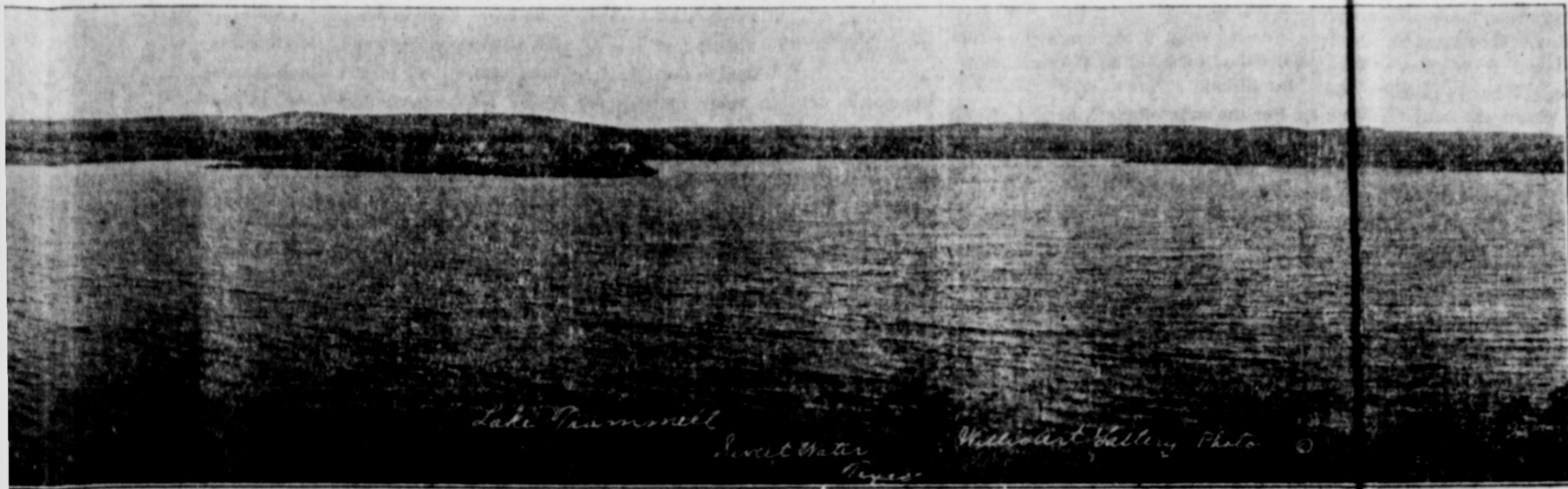
Lake Trammell Sweetwater, West Texas.

MILD EQUABLE YEAR 'ROUND CLIMATE MAKES SWEETWATER RESIDENCE IDEAL