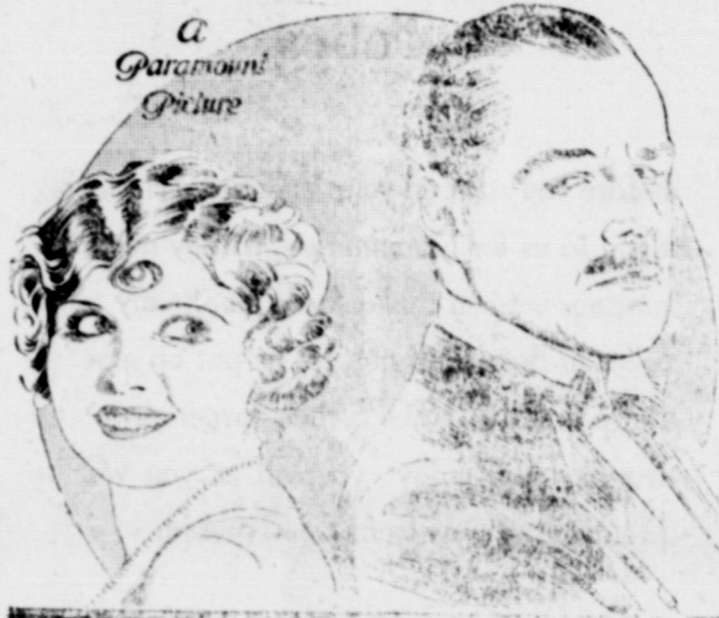
Jesse L. Lasky presents