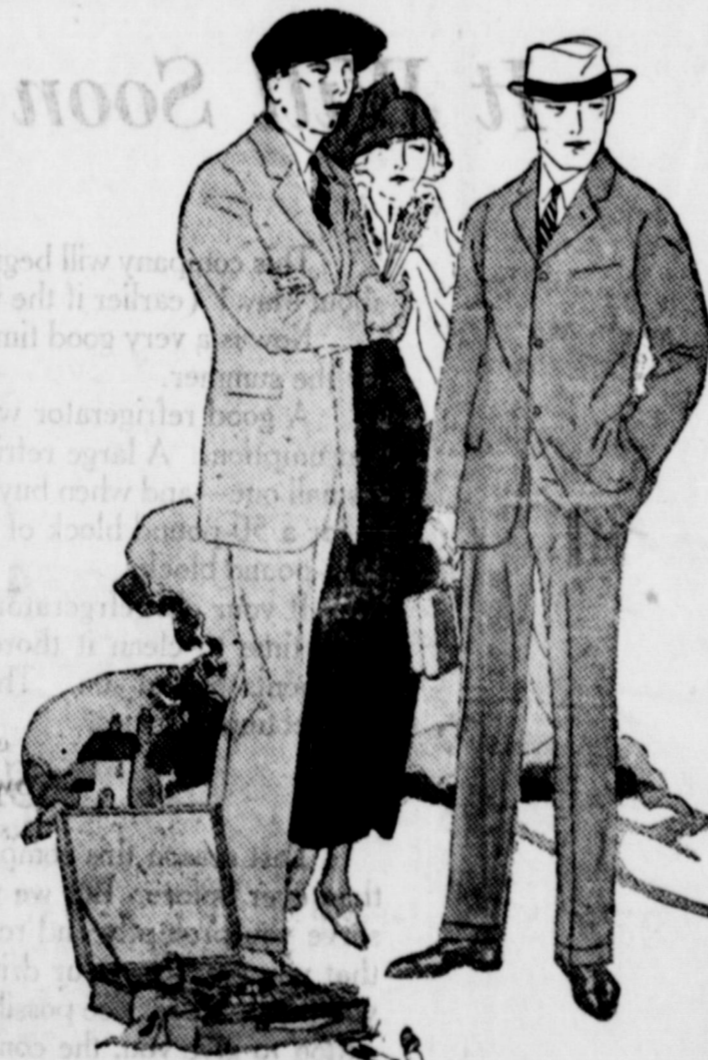
Copyright 1921 Hart Schaffner & Marx