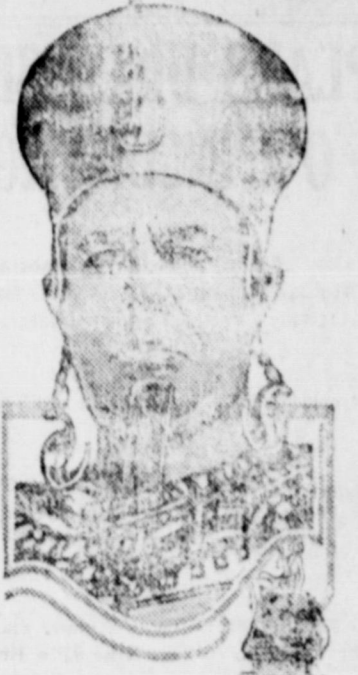
EMIL JANNINGS in this PARAMOUNT PICTURE 'THE LOVES OF PHARAOH'