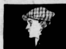
The hat grew back. Sam dug out the cap. A pack of a shaver. Had to wear his shavers to get it off. "The Peanut on the Pumpkin." Yours for the ash heap, cap!