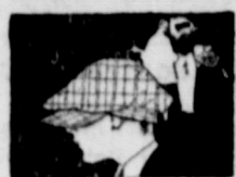
Sam bought a cap. Fitted nice and snug. Went for a haircut. "Nice and close, please."—Cold storage for YOU, cap!