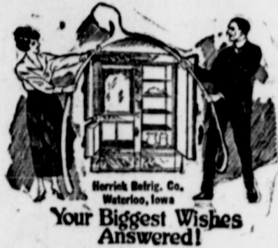
Your Biggest Wishes Answered!