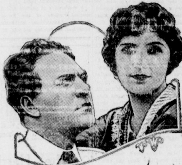
Thomas Meighan and Leatrice Joy in the Paramount Picture