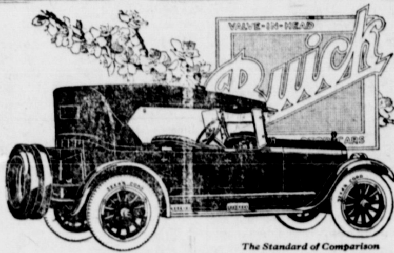
The Standard of Comparison