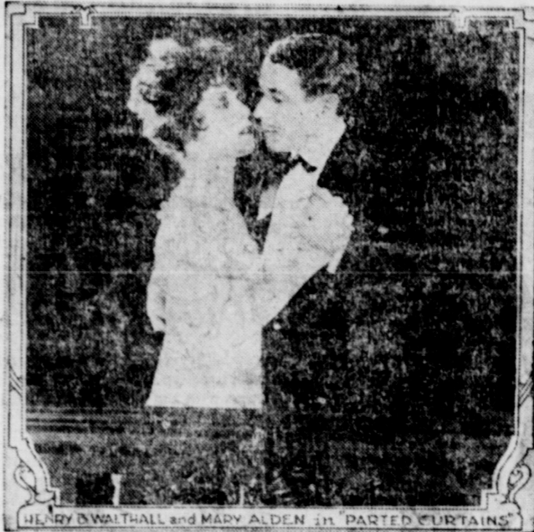
HENRY WALTHALL and MARY ALDEN in "PARTED CURTAINS"

An absorbing tale of love, treachery and sacrifice, staged amid the beauty of society and the slums of New York.