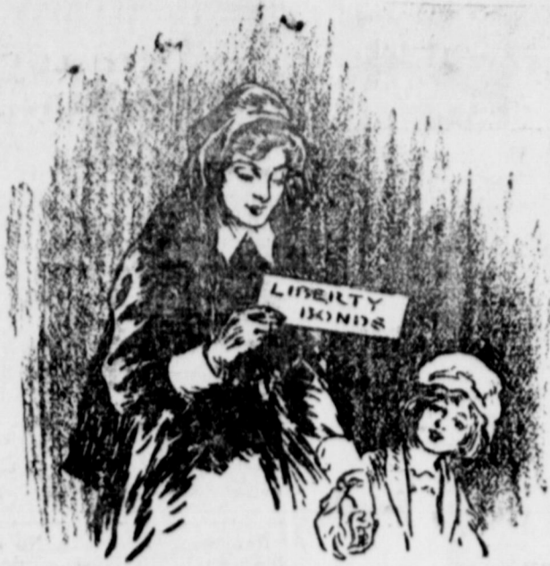
"God Never Threw Me Down Yet"

Special attention is called to the sugar situation. This article is very scarce at present, and the Food Administrator has requested, through this committee, that all consumers of sugar pursue the strictest economy in its use. The prices quoted above for sugar will prevail until the present local stocks are exhausted, after which the new stock will have to be sold at a higher price.