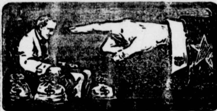
"We'll All Go Broke If We Have To—But There's No One Busted Yet!"

And what of the millions who are shedding their blood for you? How many of these have died and are going to die in vain because the people back home couldn't raise the money to crush the military power that forced them to suffer upon a peace-loving world? They are going it blind and unafraid. They have died and are going to die for humanity. God will not throw them down. Will you?