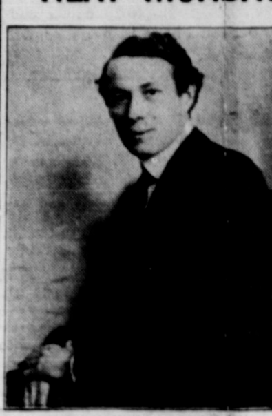
"BURNING THE CANDLE" By Turner White