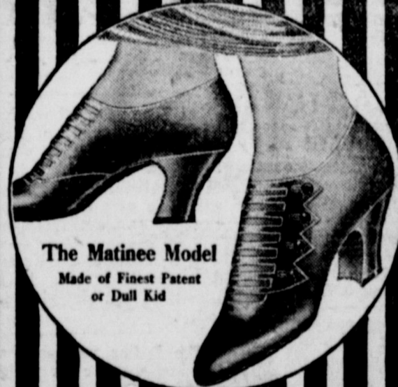
The Matinee Model Made of Finest Patent or Dull Kid