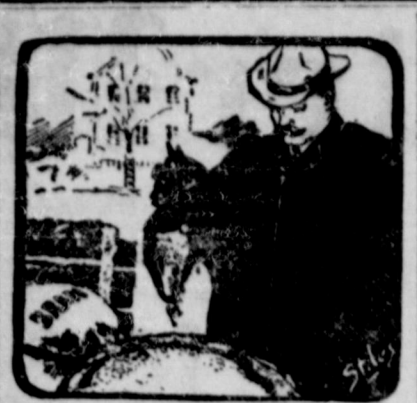
HAY, CORN AND OATS

CORK, IRELAND. THOUSAND SINNFEINERS WRECK ED THE RECUITING STATION HERE THIS MORNING WHEN THEY BECAME ANGERED AT A FAILURE TO ARRIVE OF PRISON.