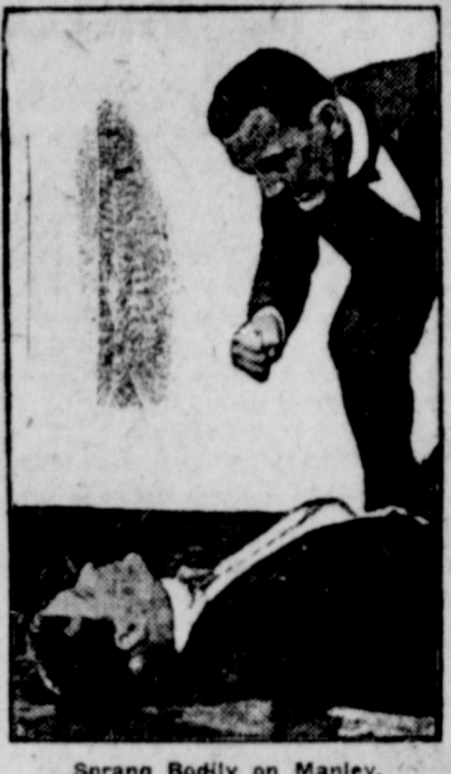
Sprang Bodily on Manley.

argument. He leaped to that startled figure, thrust his automatic against the waistline of the service coat and commanded Wrench to back up against the well As he did so a sudden shout sounded from the doorway behind him and instinctively he glanced about to ascertain the meaning of this shout. Wrench, seeing his chance, knocked