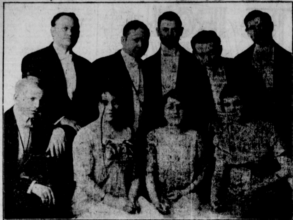
A GROUP FROM THE HAYDN CHORUS. With Redpath-Horner Chautauqua to commence here May 23rd.

"Pa, doesn't precipitation mean the same as settling?" "It does in chemistry, my son; but in business you'll find that many persons in settling don't show any precipitation at all.—Boston Transcript.