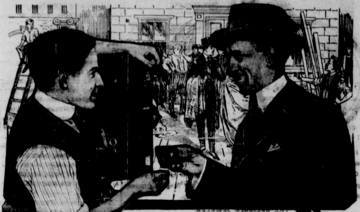
"STAR—The Pocket-Piece of Geniality"