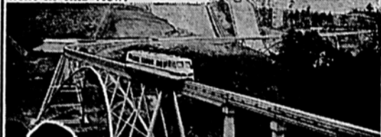
'YOMIURLAND' is Japan's Disneyland, with monorail train, giant ski jump prominent in this view.