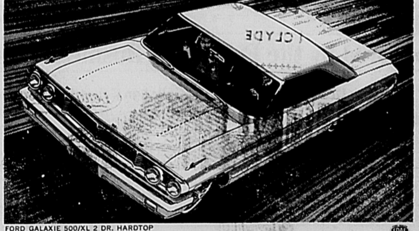
FORD GALAXIE 500/XL 2 DR. HARDTOP

Ford's sporty total performance has sent our new Ford sales soaring to an all-time high—and the result is big savings for new Ford buyers. We'll prove it by giving you "value plus" on your present car. Speaking of proof, Ford is proving its total performance in '64 NASCAR races with more wins than all other cars combined! No wonder sports fans are switching to Ford!