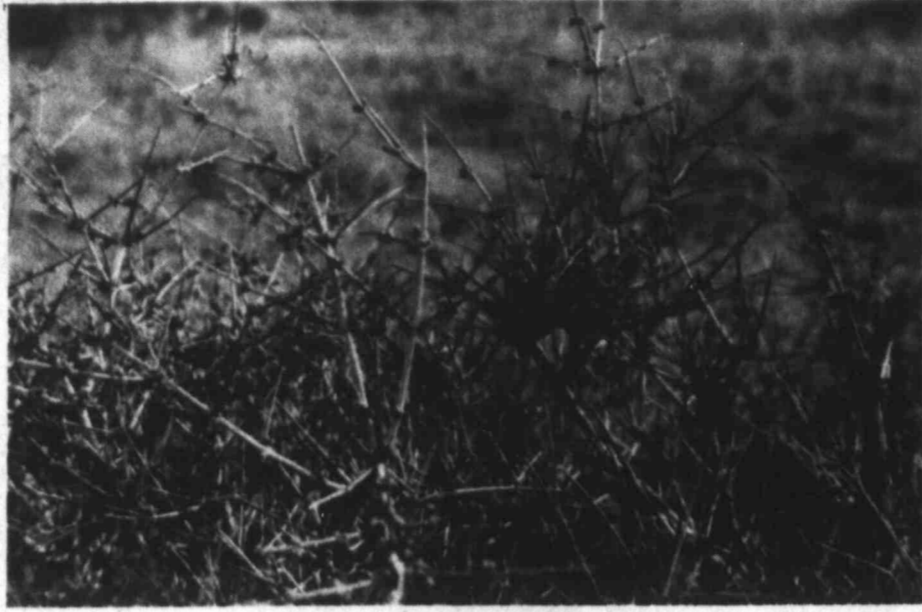
EPHEDRA — EPHEDRACEAE FAMILY Mormon tea made from plants

Species. There is also only one small colony of Cory Ephedra left in Howard County that we know of. The Ephedra Species are eaten by livestock, rodents, and deer. A tea called, Mormon Tea was made from these plants, along with a medicinal tonic used by the Indians and pioneers. An extract from Ephedra was used to combat syphilis in early medicines by doctors. The plant was named Ephedra antisiphilitica.