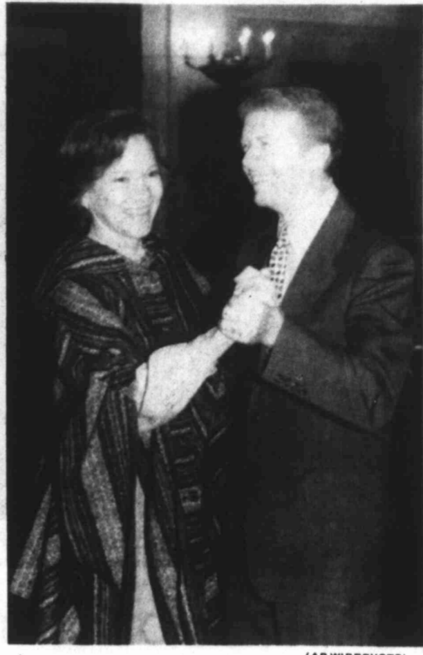
IMPROMPTU WALTZ — President and Mrs. Carter break into an impromptu waltz on the State Floor of the White House Wednesday while awaiting the arrival of Vice Premier Teng Hsiao-ping and party to sign a series of cultural and scientific agreements at the conclusion of the formal state visit.