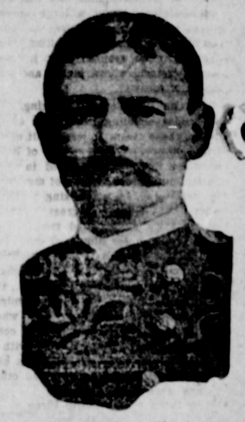
To Name Regional Directors

Brigadier General Chief of Ordce of United States Army