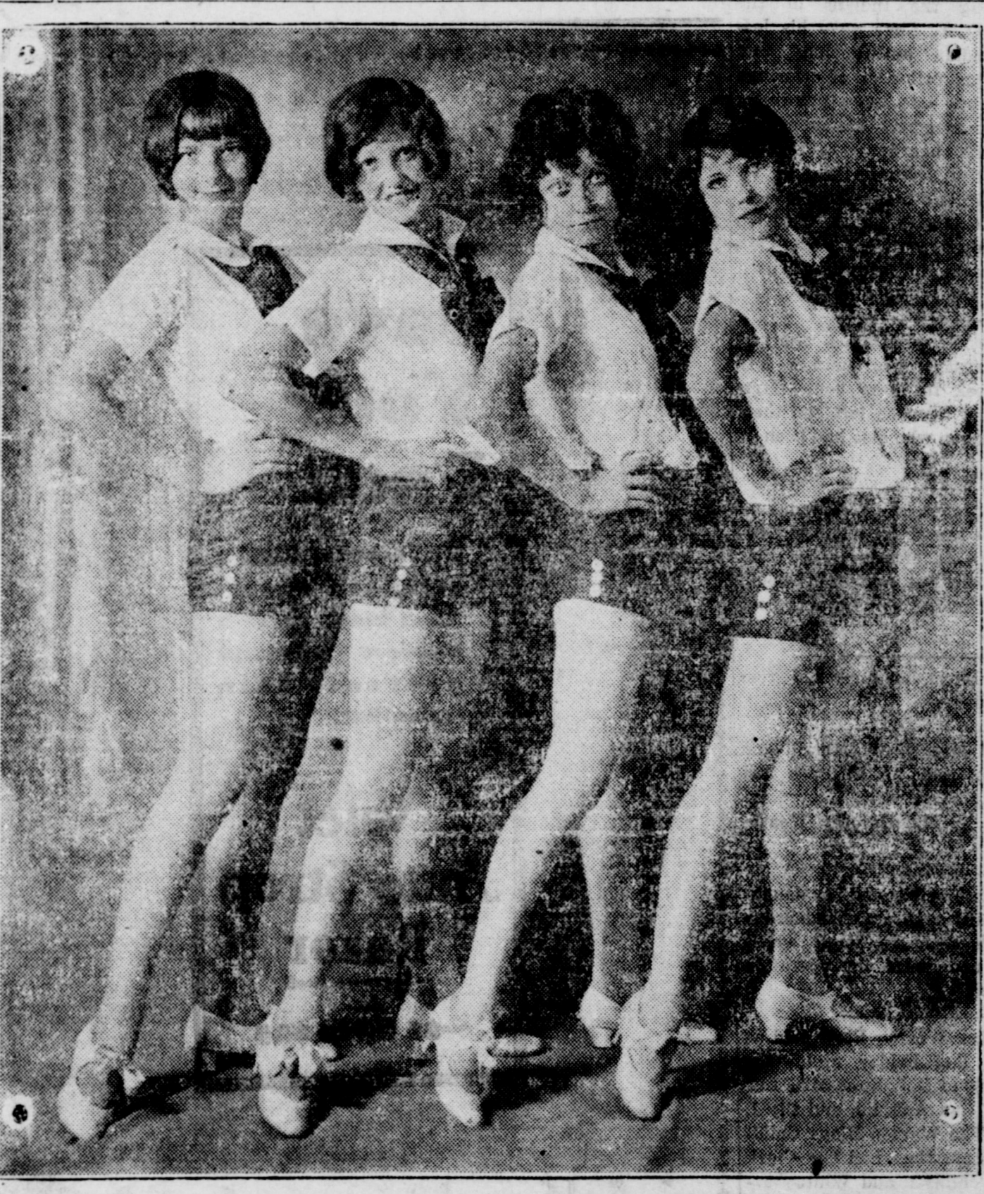
The Black Bottom Chorus are now playing at the MARFA OPERA HOUSE