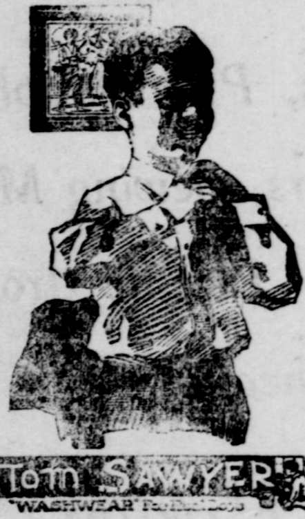
TOM SAWYER WASHWEAR

Tom Sawyer Shirts In Sport Shirts or with long sleeve, in fancy colors or plain white, in the best of materials Madras and Broadcloth. The Shirt that is made with the big IDEA - SATISFACTION, mothers buy them and see how much more service you get and they're priced reasonable too.