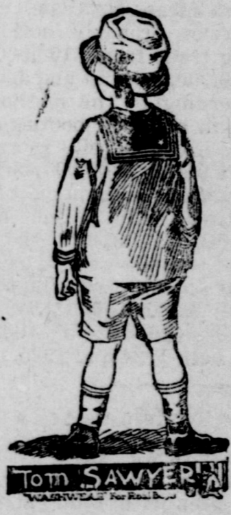
TOM SAWYER WASHWEAR

It's most campmeetin' time and what shall the youngster wear? You want to enjoy this wonderful outing- attend every service, Then insure your pleasure, enjoy every hour by supplying your needs with these good Tom Sawyer wash Suits.