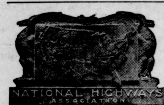
Newspaper Association Member Number 7798