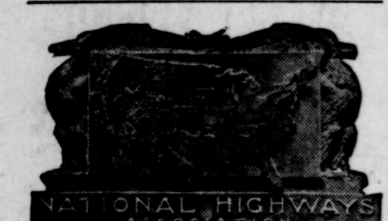
Newspaper Association Member Number 7798