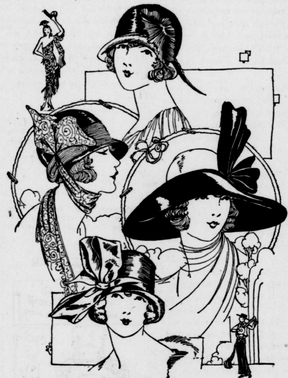
Originated in Spain.

All these style inspirations are revealed in the group of beautiful hats now, in both silk and cotton lines, lace shown here. Sometimes only a vestige leads the procession of alluring fea- of the original is to be traced in these tures in the makeup of underthings, descendants of bygone styles, but the and is nearly always in the company new arrivals are immensely becoming of ribbon. In the latter, narrow widths, -therefore adorable. All of them have worked up into little bows and ro- brims of a premeditated waywardness the big elephants are all nice with settes, are often made so that they and allowed to go as they please in me. may be pinned on and transferred any direction that will add to their cafrom one garment to another. Two pacity for flattery. Crowns are tall or three varieties of lace are used on and varied, square, round, helmetone piece, as shown in the step-in and shaped or eccentric. Felt, velvet, chemise pictured. Alencon, filet and plushes and heavy silks make the of nutriment, take val are used, or val with either of the background for rich trimmings. of others-val making the edging and which ostrich is the foremost, followed filet the emplacements when these two by many other fancy feathers, by ribare chosen. In styles blouse modes bons, laces, ornaments, embroideries,