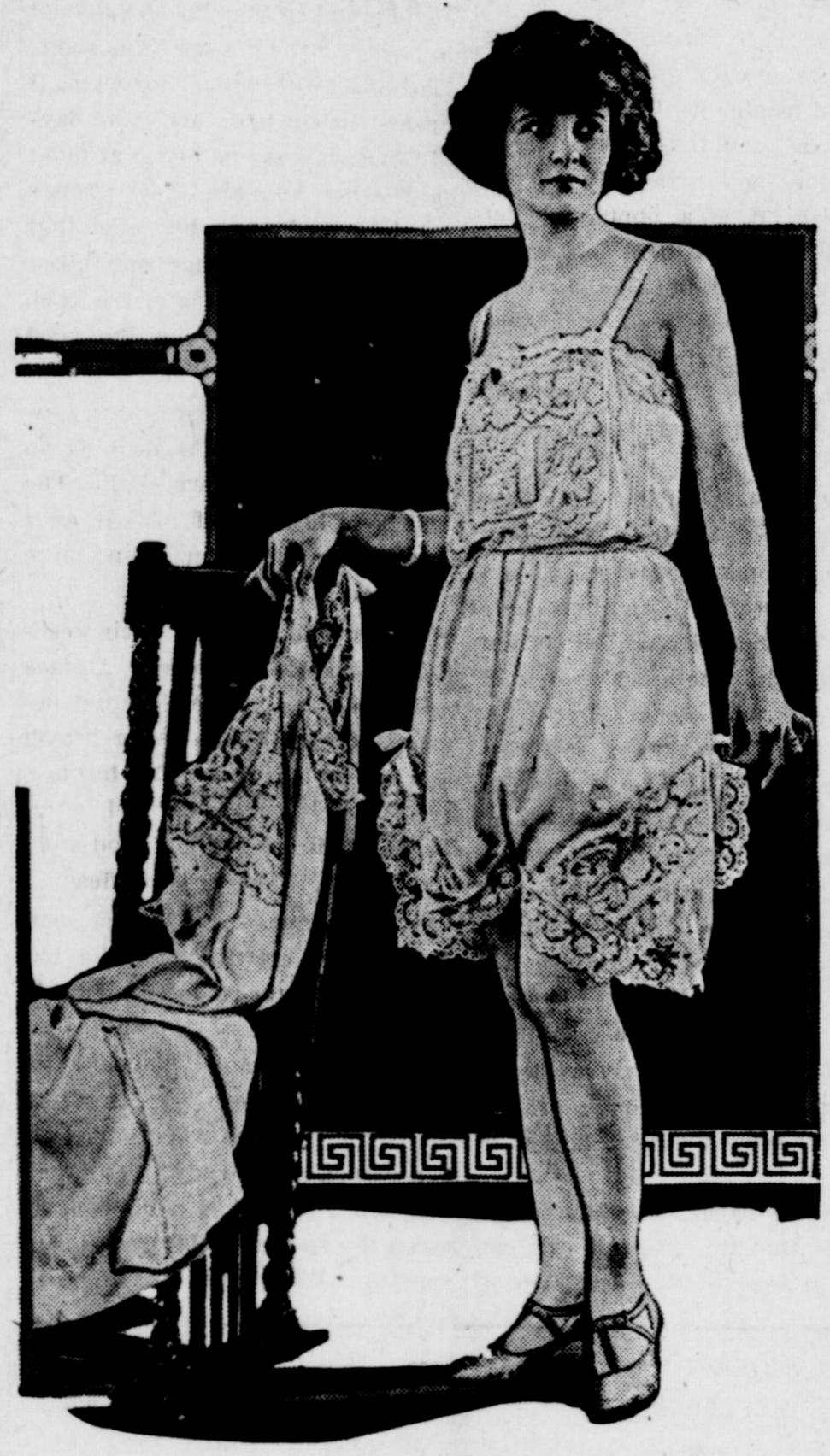
Charming Step-In and Chemise.

DESIDES its prettiness, silk lingerie | Starting in Spain and coming by Bhas the best of common sense rea- way of Paris, brilliant and dashing sons for growing more and more popu- strangers have arrived in America's lar. In wearing qualities it equals any millinery world. They lingered in the that is made of other goods, it is par- French capital long enough to change ticularly easy to launder (although their aspect somewhat, picked up royal requiring some care in this respect) company from East India, were reand for beauty it holds first place. Inforced by French directoire and sec-Silk is a wonderful medium for color ond empire styles and altogether in and color is a great factor in the suc- vaded America. Already the feminine cess of up-to-date lingerie-but all world is reconciled to the passing of