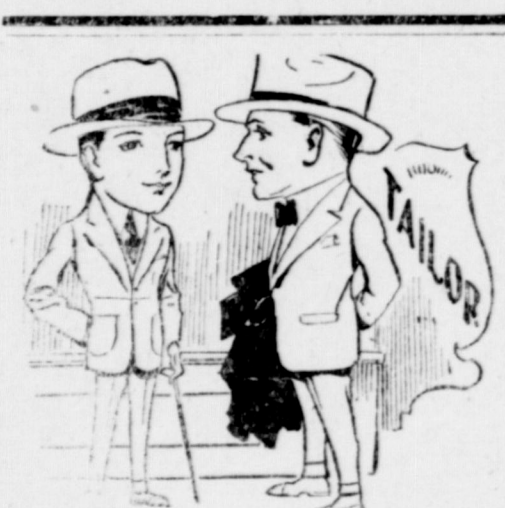
TWO WELL-DRESSED MEN

This union has a membership of betunities in financial and other ways, tween 50,000 and 60,000 men and Under the circumstances, they women. Each member pays dues undoubtedly have been justified in of 2 per cent of his earnings to supentering other lines of endeavor. port the various departments of his The general public, which includes organization. If a member dies, his every citizen, man and woman, in family receives a mortuary of about the United States, have been their $500. If he reaches the age of 60 employers while they taught the years, and has been a continuous public schools. The teachers, in member for the previous 20 years, the majority of cases, have never he receives a pension of around $35 had an organization worthy the per month for the balance of his