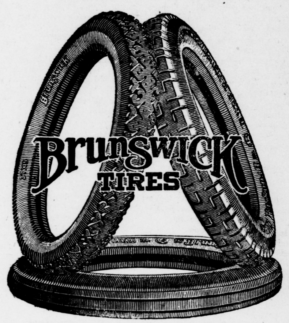
Sold On An Unlimited Mileage Guarantee Basis

THE BRUNSWICK-BALKE-COLLENDER CO. Dallas Headquarters: 611 Main St.