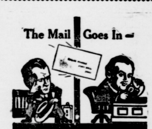
While the Salesman Waits

We can furnish you the kind of printed sales letters and circulars on HAMMERMILL BOND that will get your message in the right way to the man who can buy your goods.