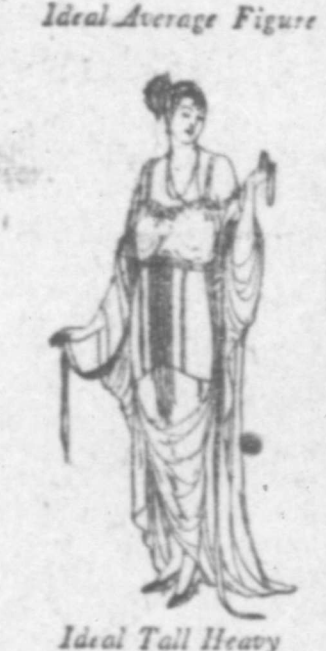
Ideal Tall Heavy