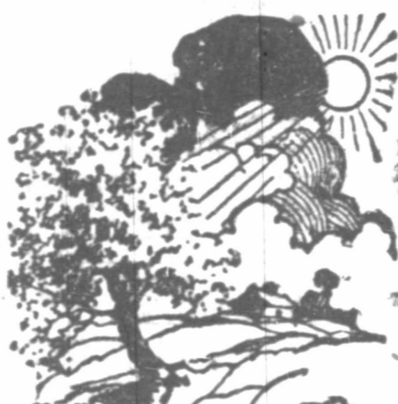
AFTER CLOUDS COMES SUNSHINE. AFTER DESPERENCY COMES JOY. AFTER SICKNESS COMES HEALTH. AFTER WEAKNESS COMES STRENGTH.

When you buy at Pecos Bargain House for cash you don't help to pay the bills.