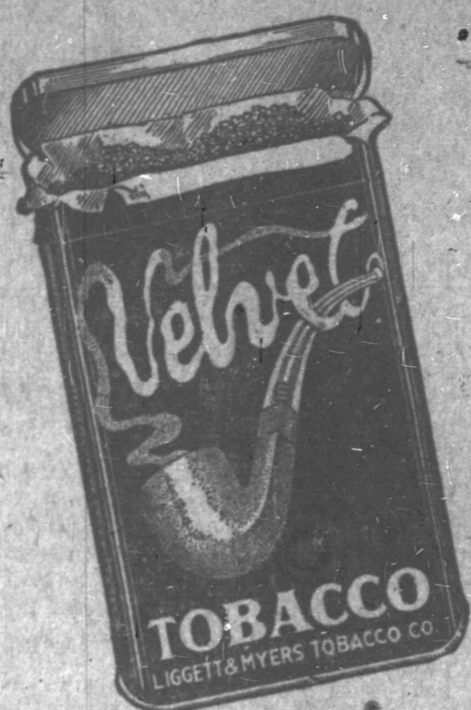
The Velvet tin is twice as big as shown here

New York.—The United States Army transport Powhatan, reported to be leaking badly about 700 miles east of New York, is in no immediate danger and probably will be floated into Halifax.