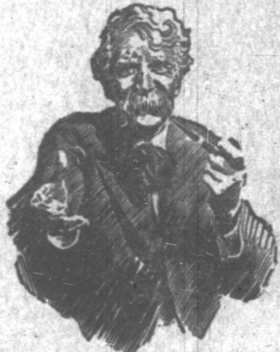
"Let Nature mellow yo' tobacco an' that tobacco will shore mellow yo' nature," says Velvet Joe. And he's pretty nearly right.

'Cause Velvet is brought up—not jerked up by the hair. It's raised as carefully as a favorite child. It's cured in the big fresh air. And it mellows away for two years in wooden hogsheads 'til it's smooth and rich as cream. The wonder would be if Velvet wasn't a whacking good pipe smoke.