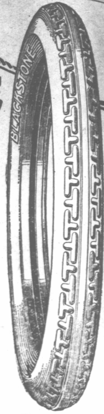
Blackstone Tires 5000 Miles

WE firmly believe that Blackstone Tires are the best made in their class and that they offer an exceptional value to the car owner who wants a good medium priced tire.