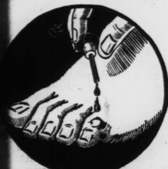
Will Come Off In One Complete

"Gets-It," the greatest corn disery of any age, makes joy-walkout of corn-limpers. It makes feel like the Statue of Liberty. a "liberty" bottle of "Gets-It"