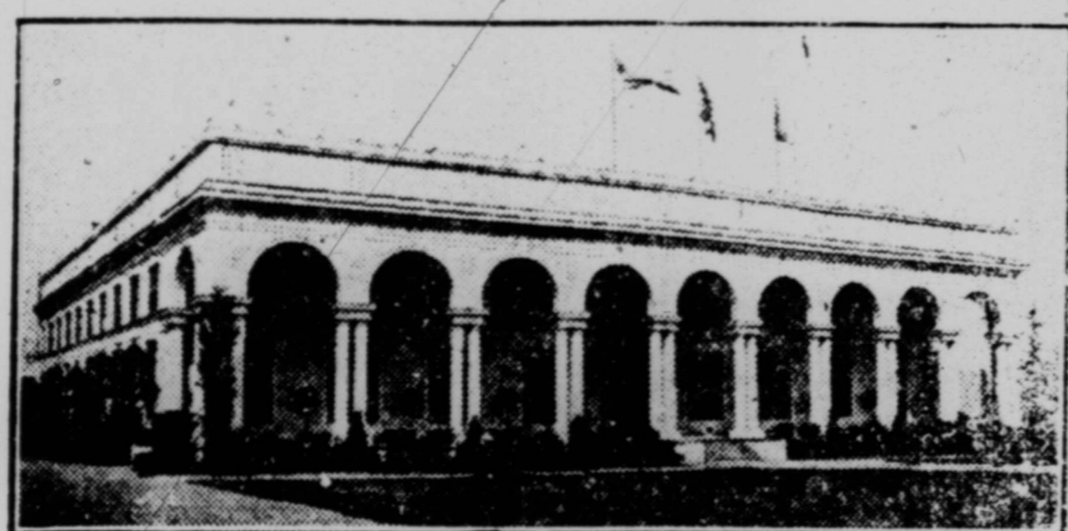
SERVICE BUILDING, FIRST OF THE COMPLETED STRUCTURES.