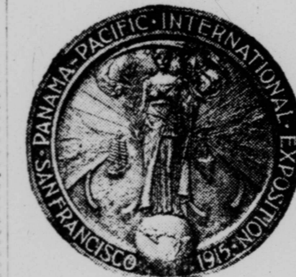
THE OFFICIAL EMBLEM OF THE PANAMA-PACIFIC INTERNATIONAL EXPOSITION SAN FRANCISCO, 1915.

The tallest structure at Harbor View, the Exposition site, will be 426 feet. Around this will be grouped huge domes, minarets and towers, which from a distance of four or five miles