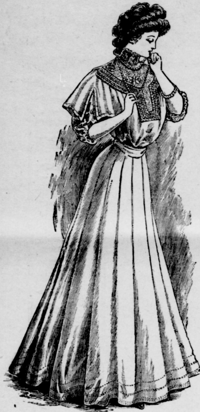
The New Idea Woman's Magazine illustrates and describes the famous Ten Cent New Idea Dress Patterns, from the models of which the illustrations for this advertisement are taken.