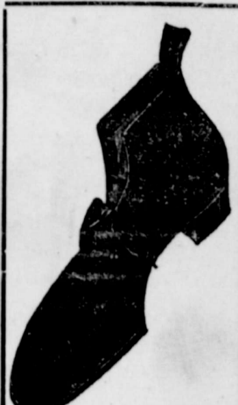
GIESECKE $3.50 SHOE For men. In all leathers and all prevailing styles. None better.

Giesecke Key Brand Shoes Are Always Best. We Have Them.