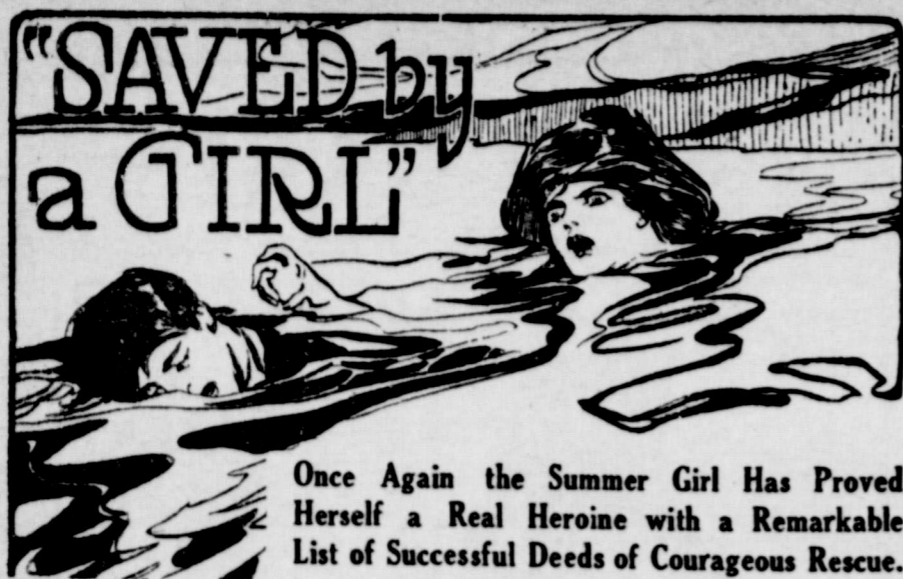
Once Again the Summer Girl Has Proved Herself a Real Heroine with a Remarkable List of Successful Deeds of Courageous Rescue.