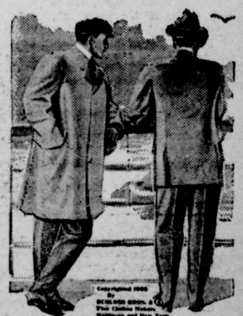
Copyright 1908 by Schloss Bros. & Co. Fine Clothes Makers Baltimore and New York

LET US DRESS YOU UP IN THE LATEST STYLE.