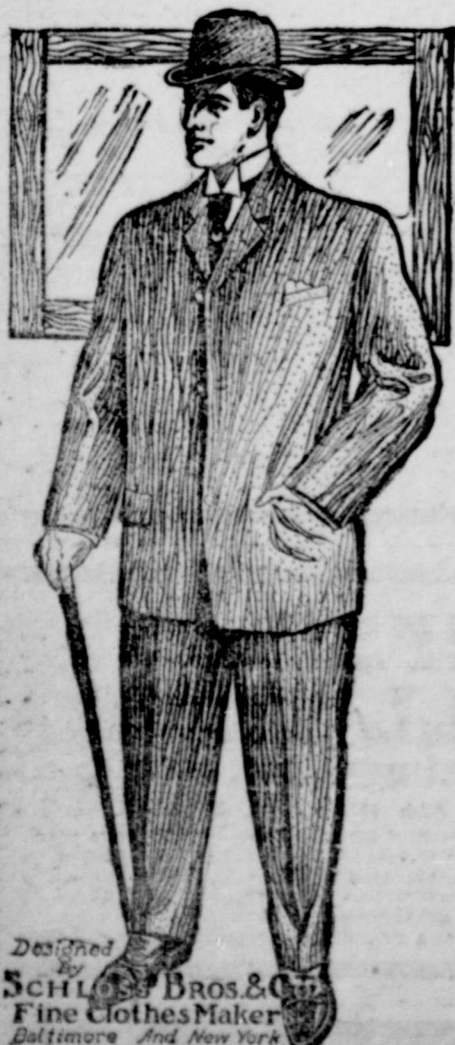
Designed by SCHLOSS BROS. & CO. Fine Clothes Maker Baltimore and New York

Such as rugs, art squares, lace curtains, curtain poles, window shades, matting, counter panes, towels, table linen shelf and table oil cloth. We have what you want, when you want it and at the right price.