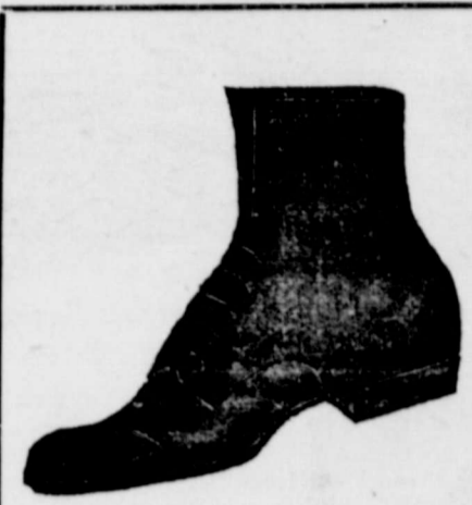
The Red Goose School Shoe is the best Shoe ever worn by school children. Strong, neat and reliable.