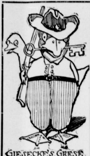
GIESECKE'S GEESE. The Regiment's pride this soldier was grieved Because from the fight he flew He'd have stood it all right and never took flight. If he'd had on a Giesecke Shoe.