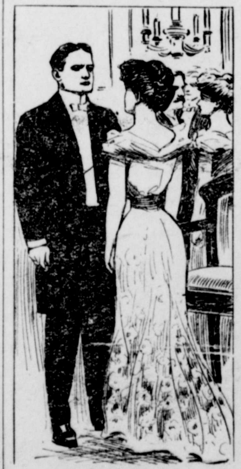
"From the Ballroom to-

Secure those homesteads, however, they would. When some of the bolder spirits announced that they proposed to become actual settlers in the