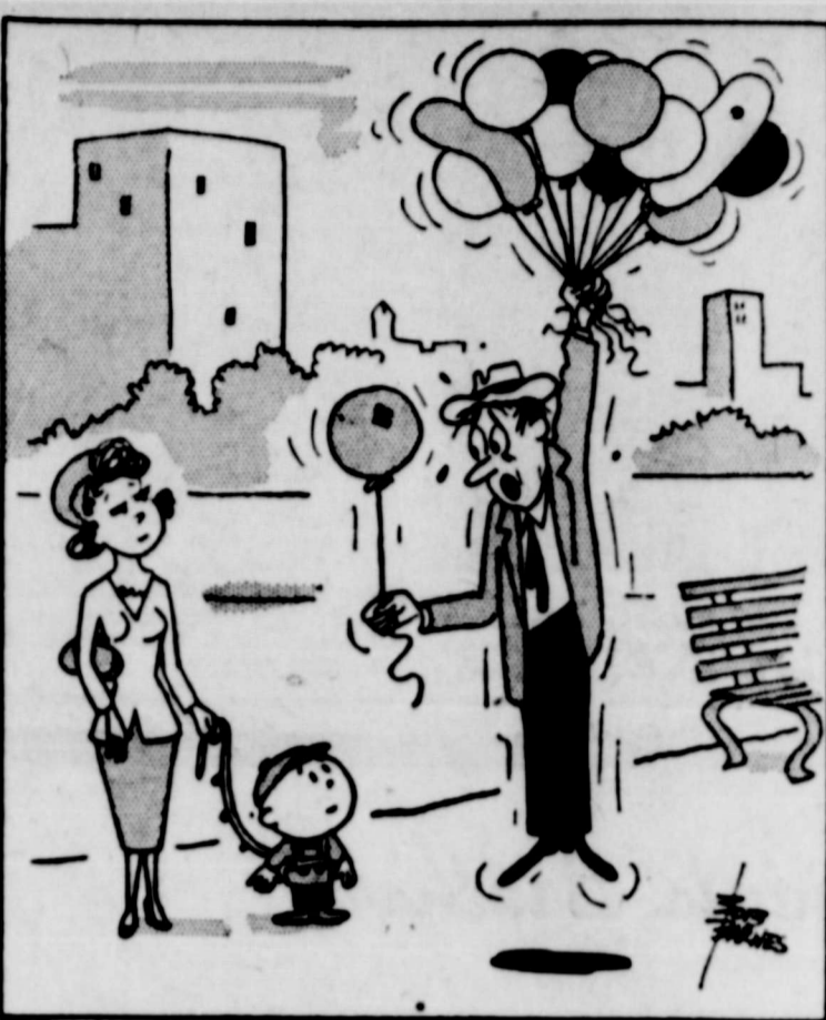
"PLEASE, Lady - Won'tcha Please Buy One? Only Ten Cents! ... Five Cents? ... Aw, PLEASE, Lady...."