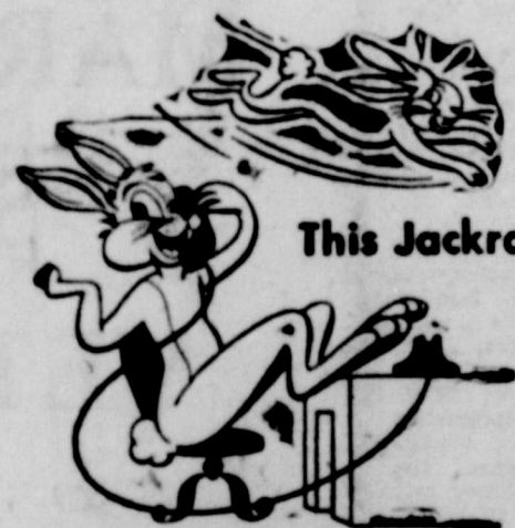
This Jackrabbit's fast

Coats Furniture Company HICO, TEXAS LONE STAR GAS COMPANY