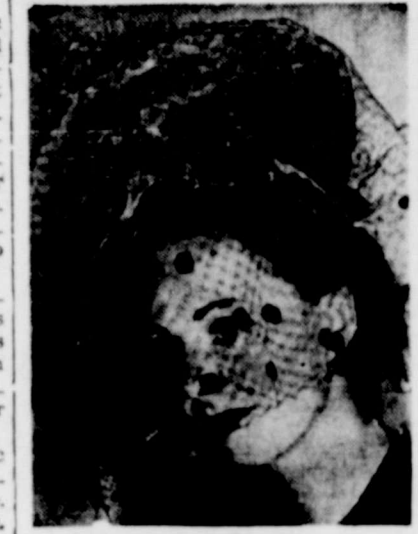
MILADY'S LONDON HAT . . . A velvet beret with a poke-bonnet effect, sporting an all-over veil which is adorned with contrasting spots. This was featured at the autumn style show in Lon-