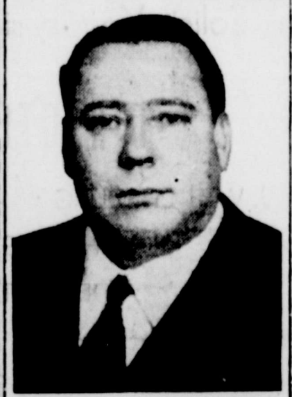
for STATE SENATOR (21st District, Bell, Bosque, Coryell, Erath and Hamilton)