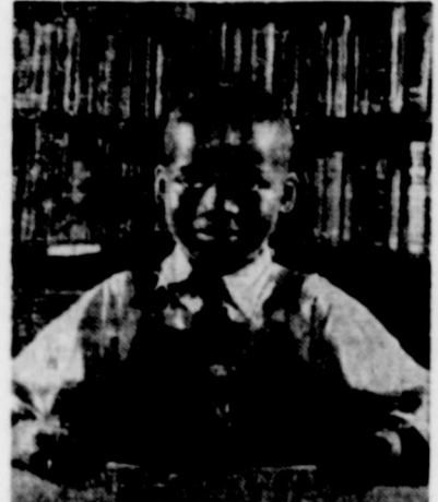
This youngster has learned early in life that knowledge can prevent illness. Health education programs are sponsored in schools by tuberculosis associations from Christmas Seal funds.