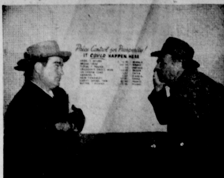
Viewing with alarm —Lou Costello and Bud Abbott (Thursday night, NBC) seem startled as they view OPA's "It Could Happen Here" sign portraying inflation in action in other countries. China's price of $96.00 for a ham sandwich disturbed the pair no end.