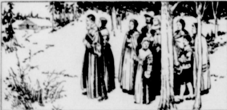
1945 SPIRIT OF CHRISTMAS 1945