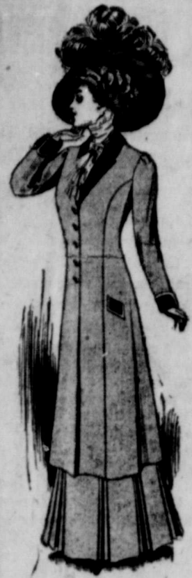
Ladies' Home Journal Patterns Nos. 4663-4742