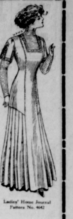
Ladies' Home Journal Pattern No. 4642