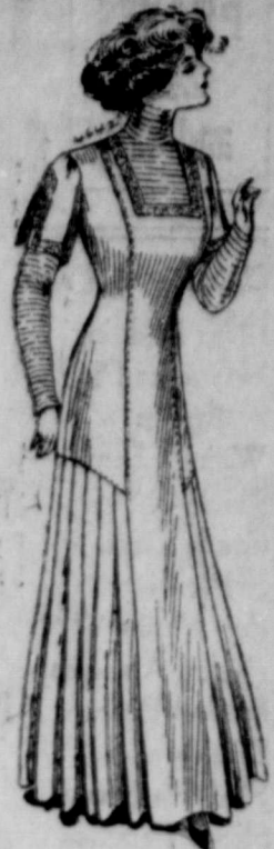
Ladies' Home Journal Patterns No. 6642