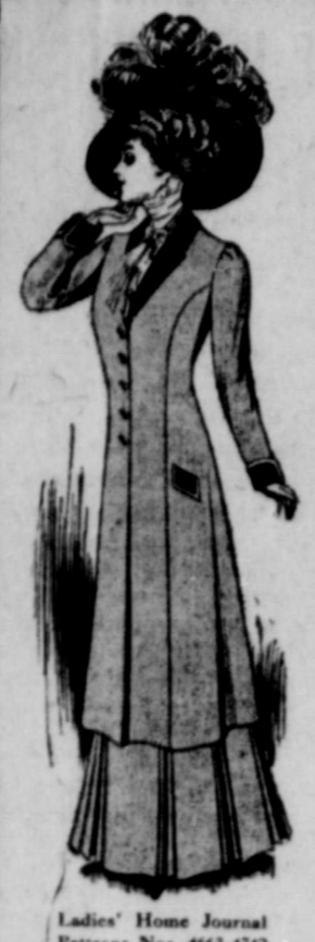
Ladies' Home Journal Pattern Nos. 4653-4742

"You don't mean to say, Lord Deppingham, that you're afraid the bells will follow the advice of that rattle-headed Saunders," said Chase, with a laugh. "Why, it wouldn't hold in court for a second. Ask Britt."