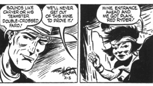
"MINE ENTRANCE AHEAD AND ME GOT PLANNED RED RYDER!"