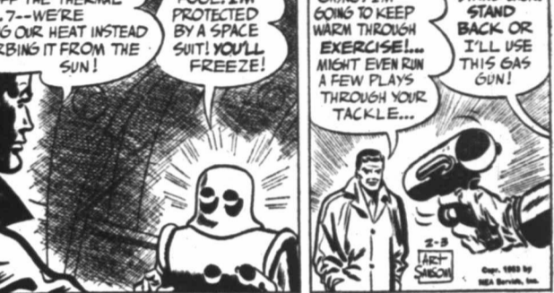
"I SHUT OFF THE THERMAL UNIT, MR. 7—WE'RE RADIATING OUR HEAT INSTEAD OF ABSORBING IT FROM THE SUN!"