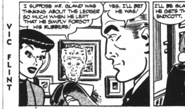
"I SUPPOSE MR. GLAND WAS THINKING ABOUT THE LEDGER SO MUCH WHEN HE LEFT THAT HE SIMPLY FORGOT HIS RUBBERS!"