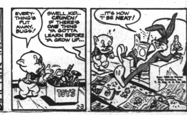
"IT'S HOW 'BE NEAT!"