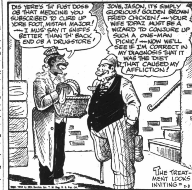
"DIS YERE'S TH' FUST DOSE OB THAT MEDICINE YOU SUBSCRIBED TO CURE UP YORE FOOT, MISTAH MAJOR! I MUS' SAY IT SNIFFS BETTER THAN TH' BACK END OB A DRUGSTORE!"