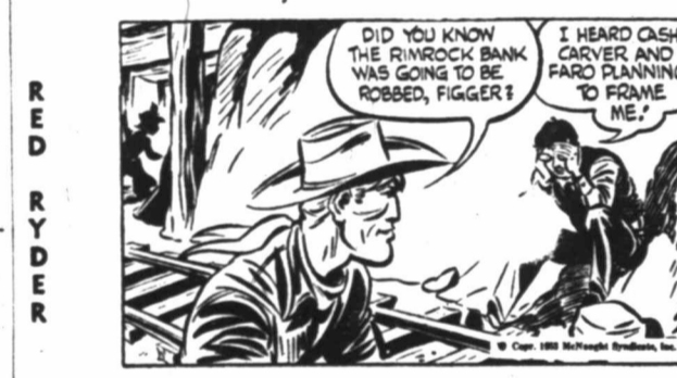
"DID YOU KNOW THE RIMROCK BANK WAS GOING TO BE ROBBED, FIGGER?"