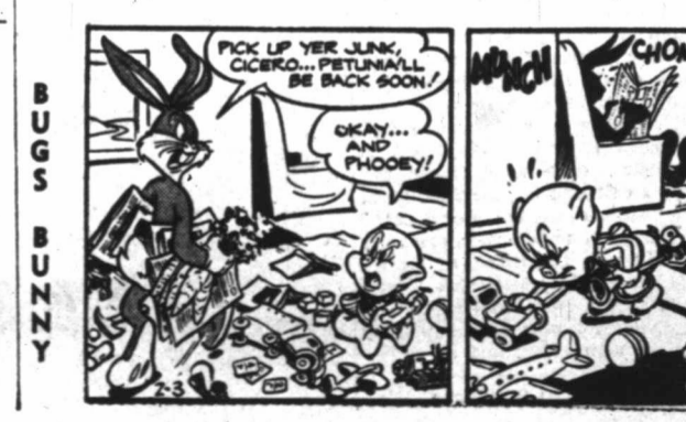
"PICK UP YER JUNK, CIGAR... PETUNIA! BE BACK SOON!"