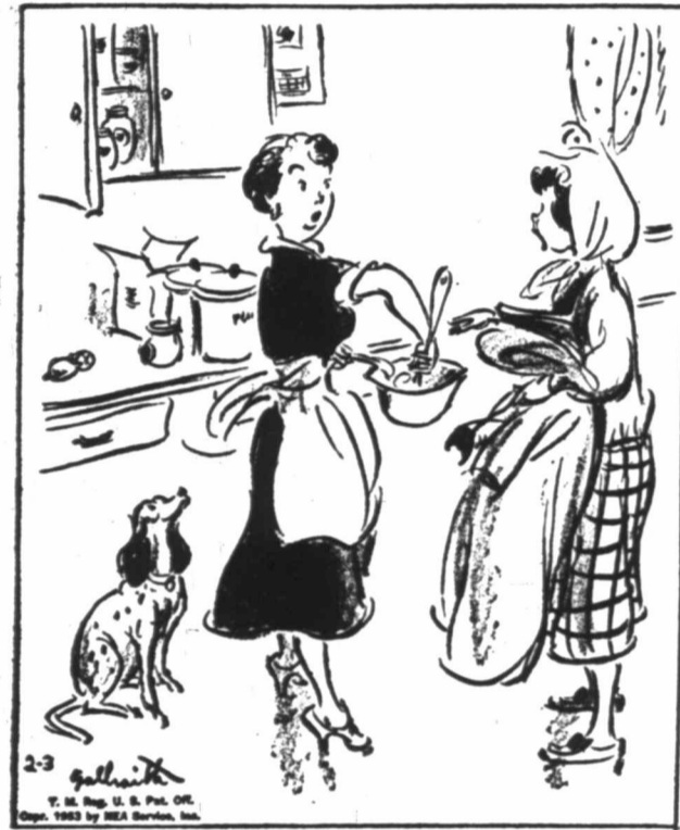
"I learned something in algebra class today, Mom—your friend Mrs. Jones bought a wig downtown Saturday!"