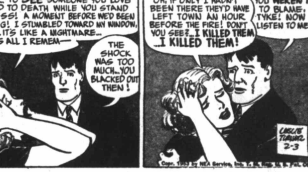
"OH, IF ONLY I HADN'T BEEN THERE THEY'D HAVE LEFT TOWN AN HOUR BEFORE THE FIRE! DON'T YOU SEE? I KILLED THEM!"