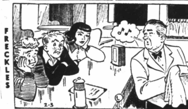
"HERE NOW! THERE'S NO LAW AGAINST WHISTLING! WHY ALL THE GUM FACES?"