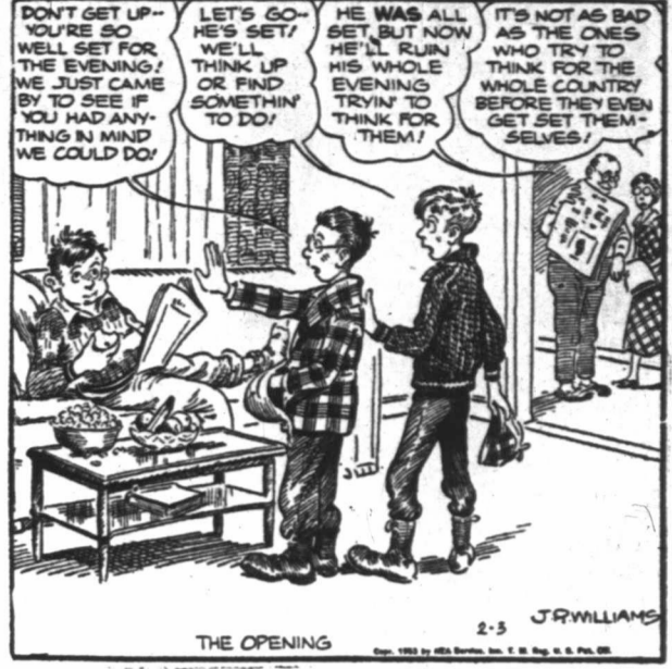
"DON'T GET UP—YOU'RE SO WELL SET FOR THE EVENING! WE JUST CAME BY TO SEE IF YOU HAD ANYTHING IN MIND WE COULD DO!"