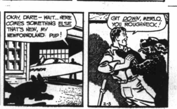
"GET DOWN, MERLO, YOU ROUGHNECK!"