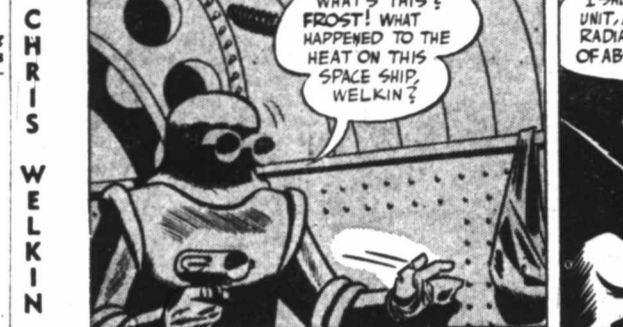
"WHAT'S THIS? FROST! WHAT HAPPENED TO THE HEAT ON THIS SPACE SHIP, WELKIN?"