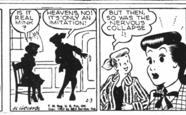
"HEAVENS NO! IT'S ONLY AN IMITATION!"