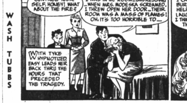
"CONTROL YOURSELF, HONEY! WHAT ABOUT THE FIRE?"