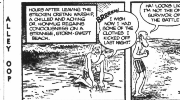
"HOURS AFTER LEAVING THE STRICKEN CRETAN WARDHIP, A CHILLED AND ACHING DR. WYOMING REGAINS CONSCIOUSNESS ON A STRANGE, STORM-SWEPT BEACH."