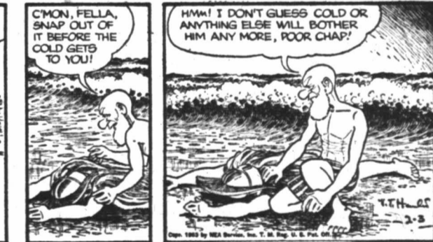
"HMM! I DON'T GUESS COLD OR ANYTHING ELSE WILL BOTHER HIM ANY MORE, POOR CHAP!"