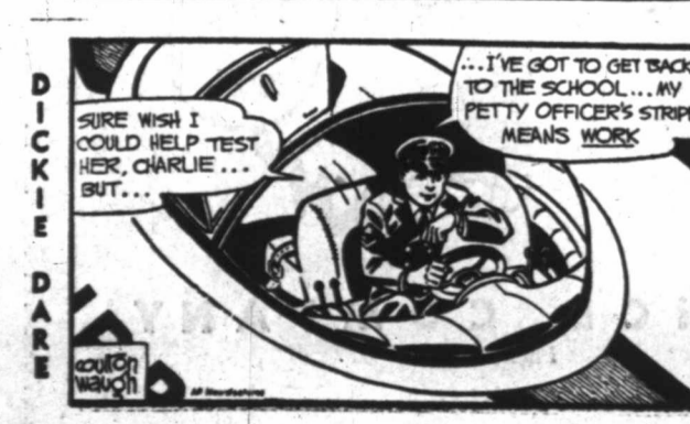
"SURE WISH I COULD HELP TEST HER, CHARLIE... BUT..."