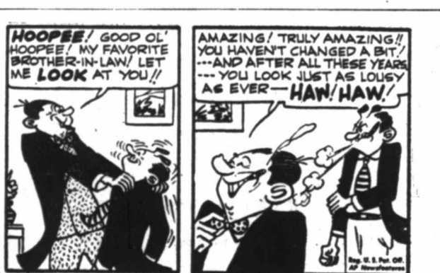
"AMAZING! TRULY AMAZING! YOU HAVEN'T CHANGED A BIT... AND AFTER ALL THESE YEARS... YOU LOOK JUST AS LOVELY AS EVER—HAW! HAW!"