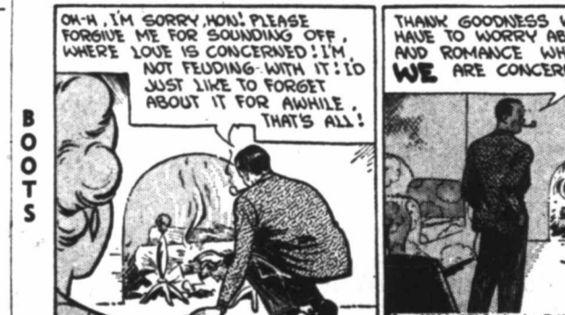
"OH-H, I'M SORRY HON! PLEASE FORGIVE ME FOR SOUNDING OFF, WHERE LOVE IS CONCERNED! I'M NOT FEUDING WITH IT! I'D JUST LIKE TO FORGET ABOUT IT FOR AWHILE, THAT'S ALL!"