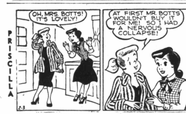
"OH, MRS. BOTTS! IT'S LOVELY!"