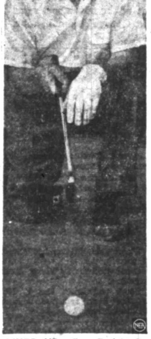
LINED UP—Gen. Dwight D. Eisenhower is the most ardent golfer ever elected President of the United States.

In ancient Rome it was the custom for a girl to offer her dolls on the altar of Diana when she reached maturity.