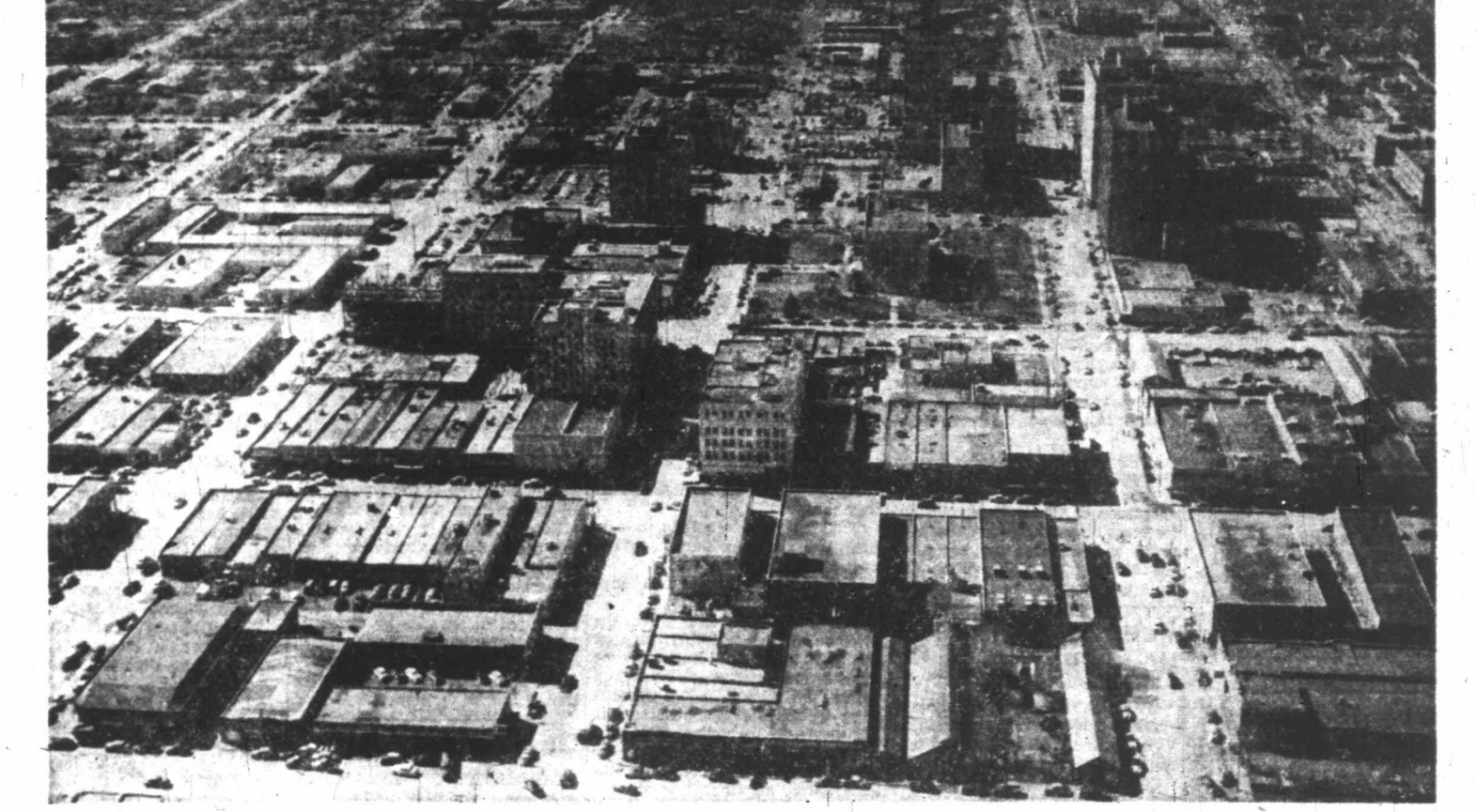
Aerial view of Midland—'Headquarters City of the Permian Basin'