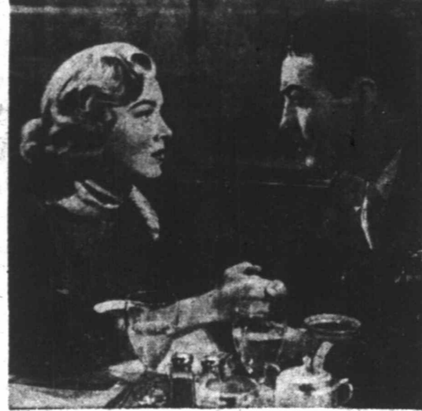
STIRRING DRAMA—The story of two persons whose private lives were dramatically affected by the husband's unprecedented war responsibility is brought to the Yucca Theater screen through Tuesday. It is the stirring drama, "Above and Beyond," with Robert Taylor and Eleanor Parker in the starring roles.

"After she had gone 10 paces past them, they turned, and she gave them the eye again. Then Holmes, turned to Brandeis and sighed, "Ah, to be 70 again!"