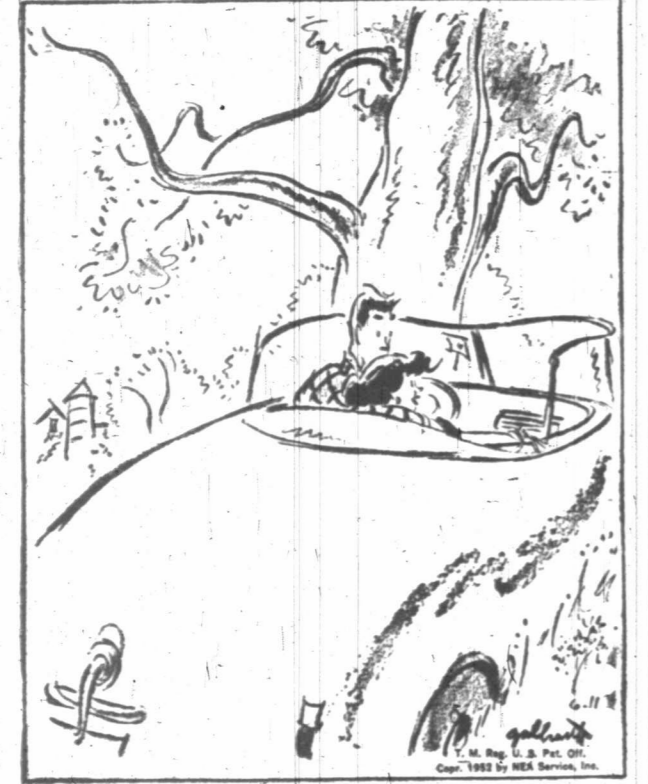
"Oh, I've already written in my diary that you proposed!"