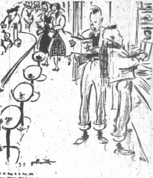
"There they are now—just keep on reading till they've paid for their sodas!"

King County Wildcat-Burdell No. 1 W. R. Ross, 330 feet from north and 330 feet from east lines of section 56, block A. R. M. Thompson survey, rotary, 5,500 feet depth. Martin County Amended: Germana-Union Sulphur & Oil Co. 1 Snyder & Arnette, 1,980 feet from south and 660 feet from west lines of section 30, block 36, T-1-S, T&P survey, rotary, 8,500 feet depth. To deepen. Midland County Tex-Harvey - Phillips No. 4-U TXL, 662 feet from south and 1,982 feet from east lines of northeast quarter of section 1, block 37, T-3-S, T&P survey, rotary, 7,300 feet depth. Tex-Harvey-Amerada No. 8-31 H. L. McClintock, 660 feet from north and 660 feet from east lines of section 31, block 36, T-2-S, T&P survey, rotary, 8,000 feet depth. Driver-Magnolia No. 9 Sam Preston, 660 feet from north and 1,980 feet from west lines of section 23, block 37, T-4-S, T&P survey, rotary, 7,400 feet depth.