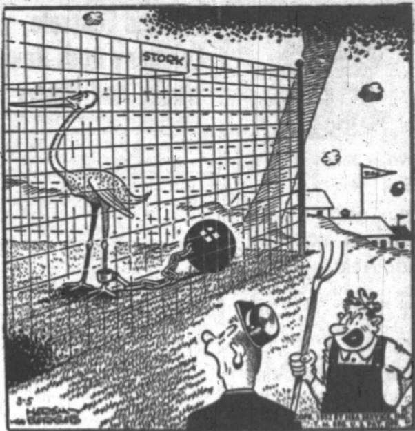
"Well, what would you do if he brought you triplets?"