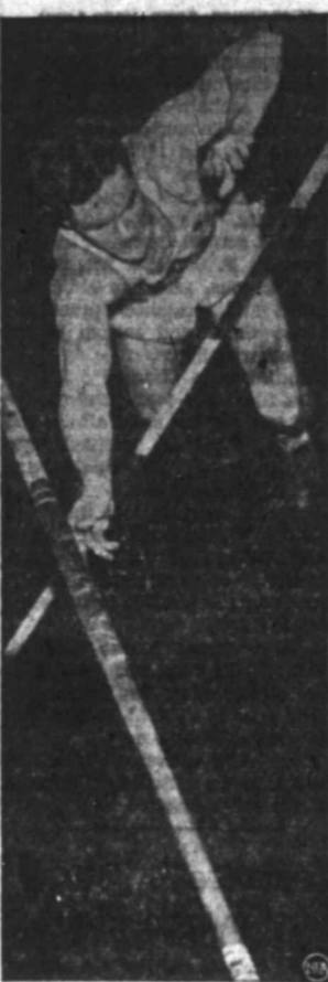
HIGH MAN — Bob Richards launches the major indoor season and his Olympic drive in the Philadelphia Games, Jan. 18. The national decathlon champion and James E. Sullivan Memorial Trophy winner has cleared 15 feet in the pole vault seven times.