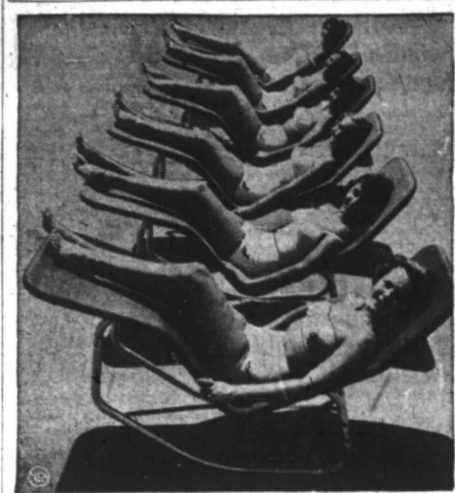
LAZY BONES —Just lying in the sun is becoming to these six beauties at Daytona Beach, Fla. It's enough to make a fellow think of taking up beachcombing.