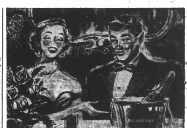
Jenett found herself seated next to Peter Surinoff at the dinner table, presumably because she was nearest his age.