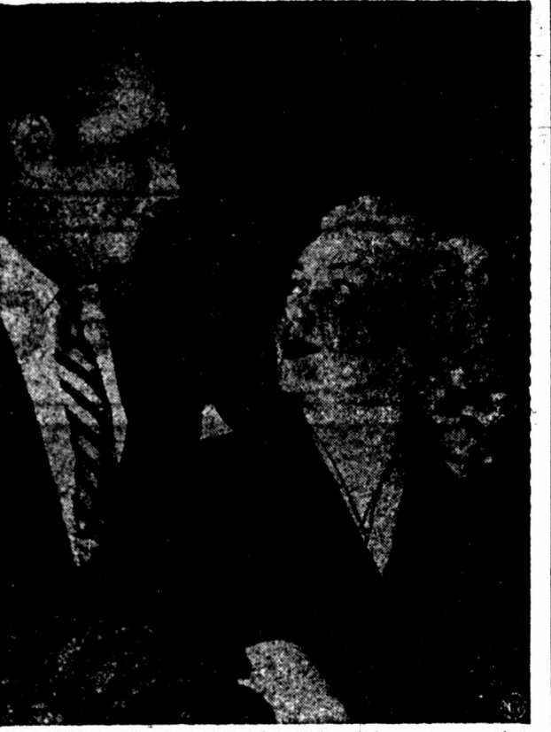
TOPPINGS ON THE ROCKS? —Hollywood reports say that movie queen Lana Turner and husband, Bob Topping, have reached a "misunderstanding" stage in their three-year-old marriage. The couple is seen above during a more blissful period.