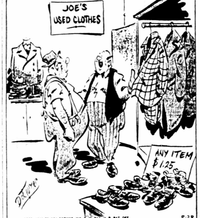
"Here's a bargain—a one-owner job! Fella was a postman—in uniform six days a week and spent his vacation at a nudist camp!"