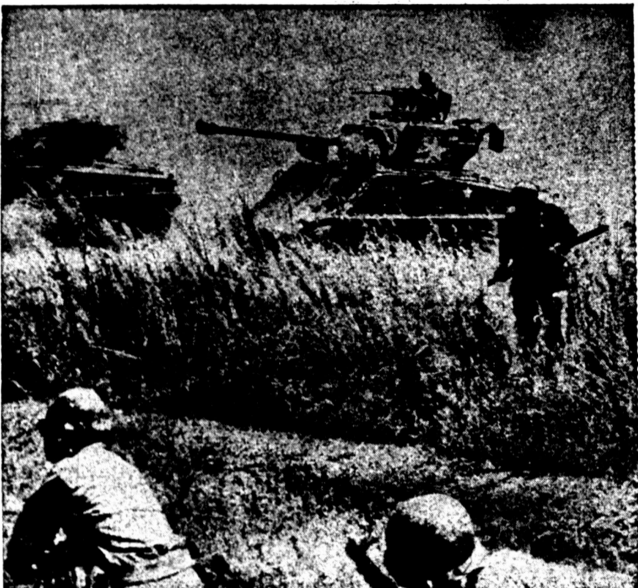
THE WAR GOES ON —News reports say the Korean war has lulled during the often-interrupted Kaesong truce talks, but for GI's engaged in a fire fight, like these, it's still a man-sized war. The Yanks have left their medium tank to set up a machine gun during an attack on a North Korean bunker. The action is fast—and deadly.

See latest models Smith-Corona Office and Portable Typewriters, Baker Office Equipment Co., Dial 4-6608, 511 West Texas.—(Adv.)