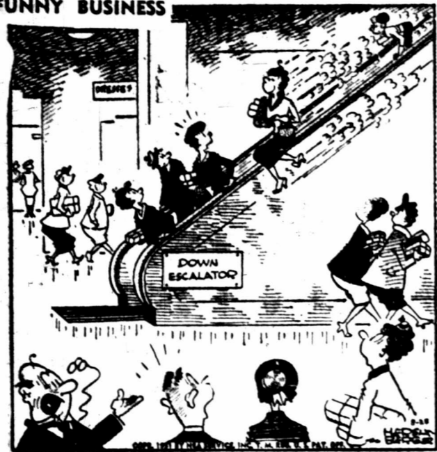
"Tell that young lady we don't allow side-saddle riding!"