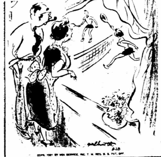
"She's beating all the men and I don't like it! How does she expect to win a husband if she keeps that up?"